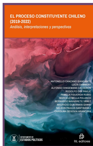
EL PROCESO CONSTITUYENTE CHILENO (2019-2022)