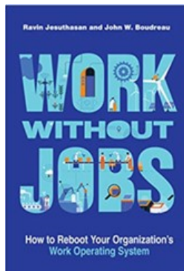
WORK WITHOUT JOBS