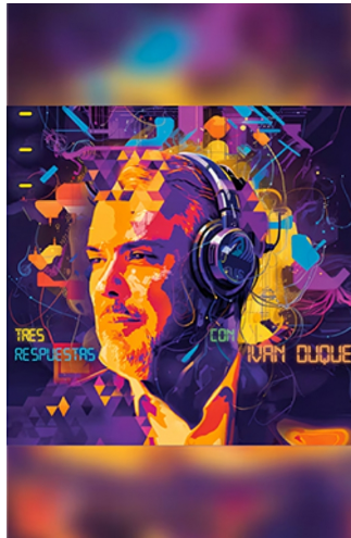
PODCAST: TRES RESPUESTAS CON IVÁN DUQUE