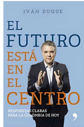
EL FUTURO ESTÁ EN EL CENTRO