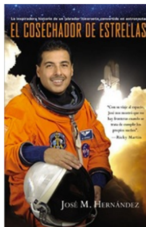
EL COSECHADOR DE ESTRELLAS