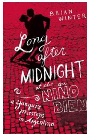
LONG AFTER MIDNIGHT AT THE NINO BIEN